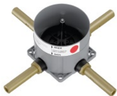
IMMAGINE - PICTURE